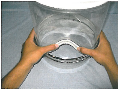
Flexible Quick Connection